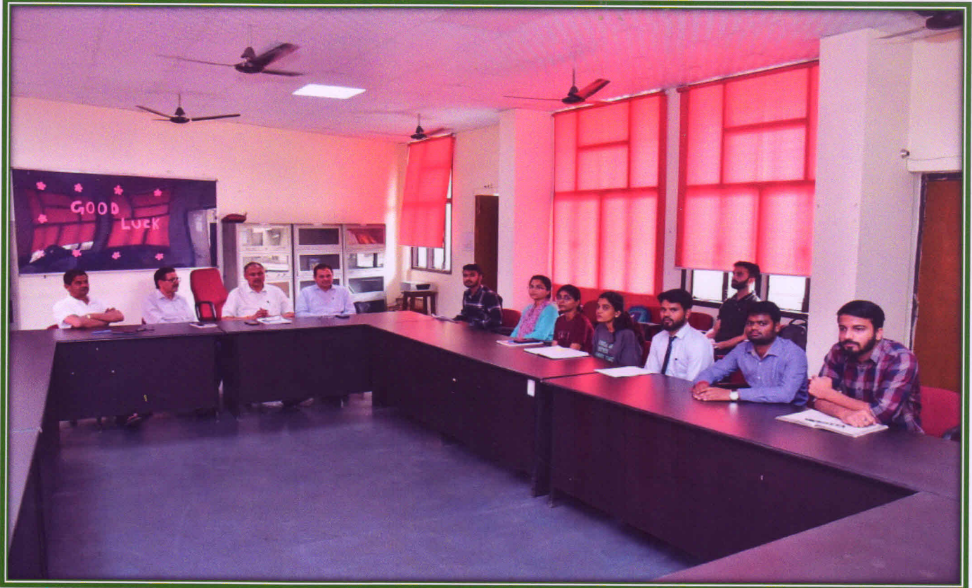
Conduction of mock interview for under graduate and post graduate final year students by Student Placement Cell on 1 st May, 2023.